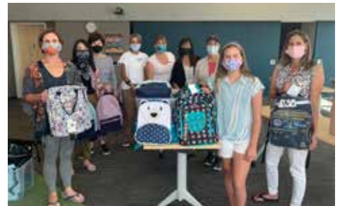
Back-to-School Backpacks Filled with School Supplies