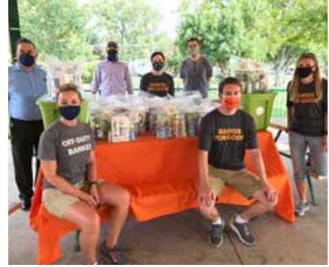
Members of the FirstBank Senior Leadership Team Made and Underwrote 25 Family Toiletry Bags