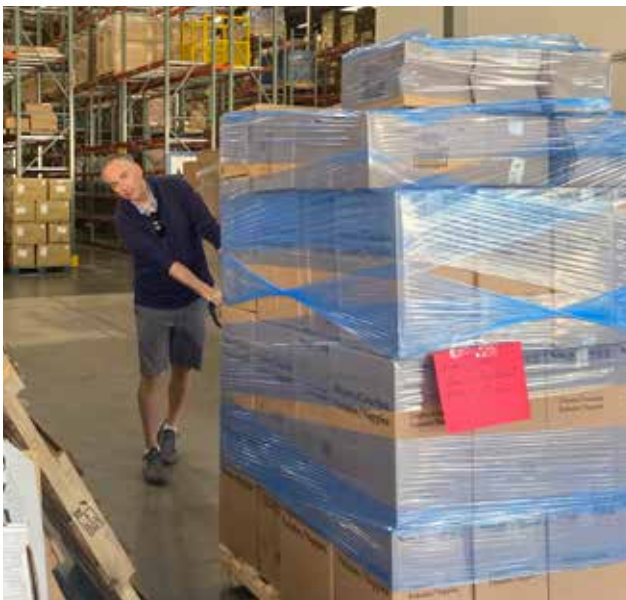
HomeAid Colorado Donated More Than 24,000 Diapers to There With Care Through Its Builders for Babies Diaper Drive

Y ay, Builders for Babies! We are grateful for their support through their generous donation of 24,504 diapers for families! It's one less worry for parents and gives them the relief to use their resources in other areas of need during their child's critical illness.