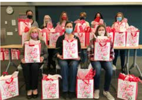
Valentine's Day Bags