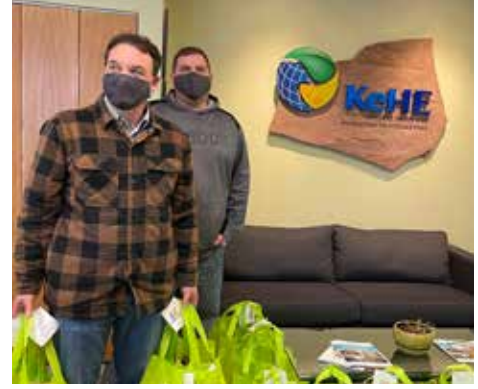
KeHE Distributors Underwrote and Assembled 75 Easy Meal Care Bags