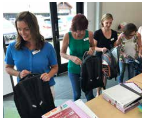
Members of the Volunteer Group Bin Blessed Filled 50 Backpacks With School Supplies