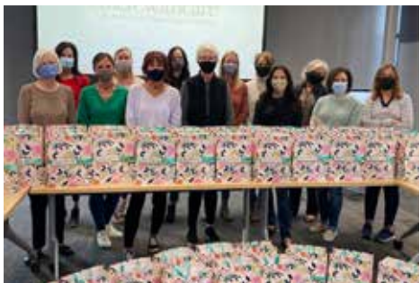
Mother's Day Bags