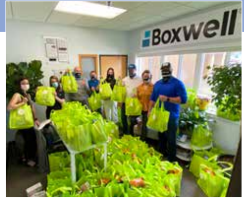
Boxwell Assembled 100 Easy Meal Care Bags with Supplies They Bought, Assembled and Delivered