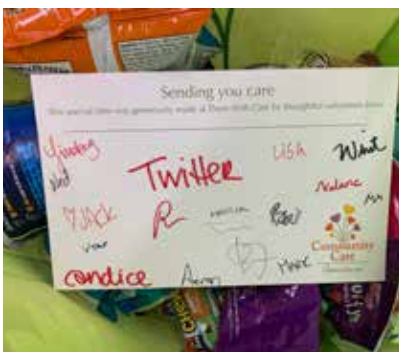
Easy Meal Care Bag Assembled by Twitter Employees