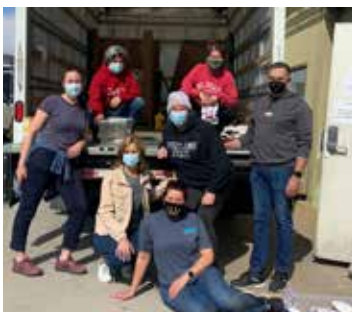
Staff and Volunteers After Unloading Truck Full of Supplies from Amazon