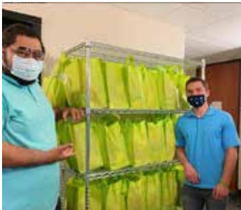
Optimal Home Care with Weekly Delivery of 25 Easy Meal Care Bags