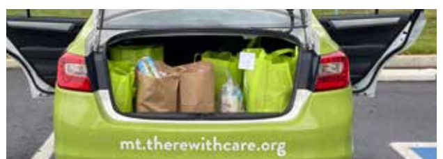
Full Carload of Deliveries to Four Families in the Neo-Natal ICU at Monroe Carell Jr. Children's Hospital at Vanderbilt