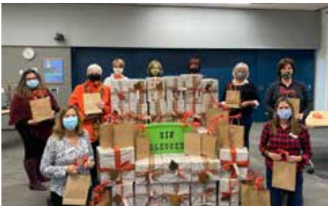
Crock-pot Care Kits for Thanksgiving

If you’re interested in learning more about Bin Blessed or having a collection bin on your porch, please contact Mellenie Goebel at mellenie@therewithcare.org .