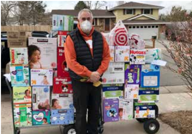
Rocky Mountain Diaper Depot Donated 9,700 Diapers and 100 Packs of Baby Wipes

Shout out to the Rocky Mountain Diaper Depot for their support with a donation of 9,700 diapers! During a medical crisis, babies can go through twice as many diapers as a healthy child, and this can add financial stress for parents. This donation will help ease families' financial burdens and ensure they receive these everyday essentials.