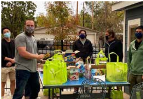
K Financial Assembled Easy Meal Care Bags