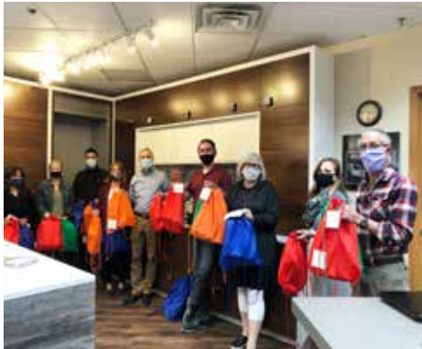
Wedgewood Cabinetry Employees Made 60 Activity Care Bags