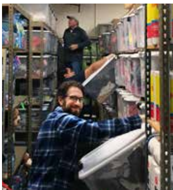
Conscience Bay Company Employees Organized the Boulder Warehouse