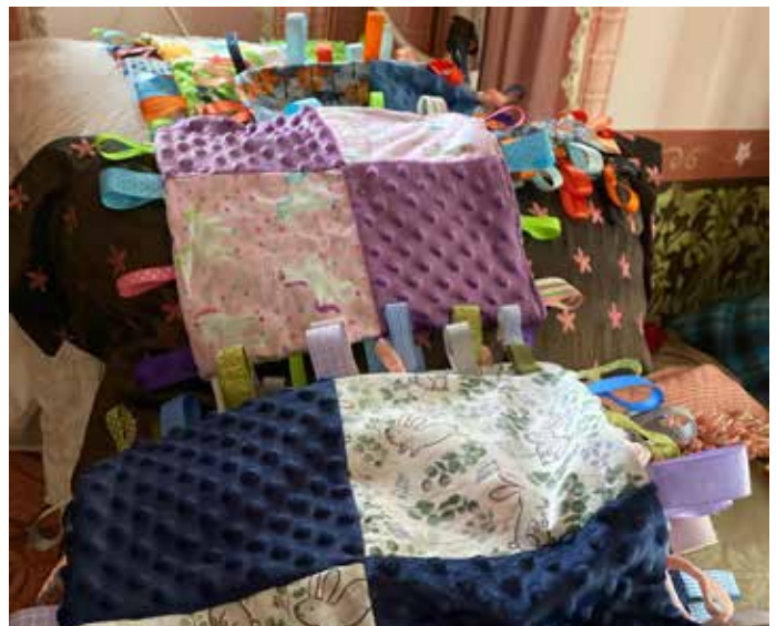
Baby Blankets Homemade with Love