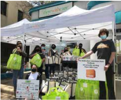
FirstBank Employees Participated in Amp the Cause's Community Day and Made 150 Care Bags