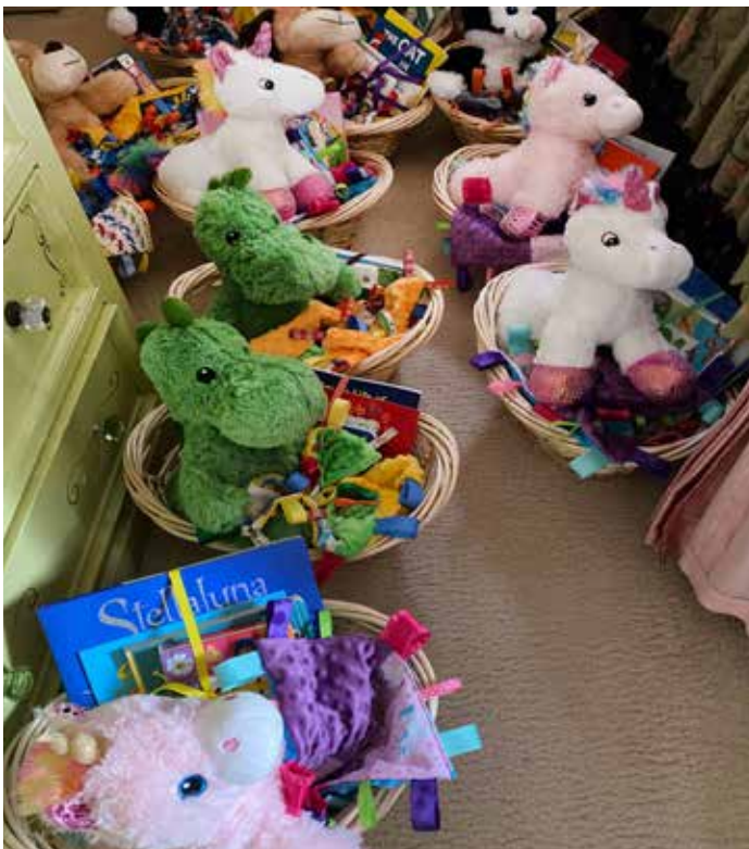
Baskets Ready to be Delivered to Families