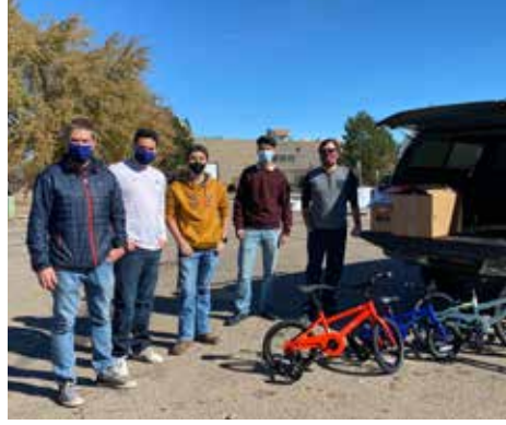
K Financial Donated Bikes, As Well As Underwrote and Assembled 30 Easy Meal Care Bags Quarterly