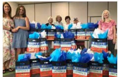
Father's Day Bags